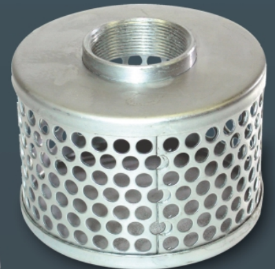
Standard Suction Strainer w/ Small Openings