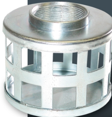
Trash Type Suction Strainer w/ Large Openings

www.springerpumps.com info@springerpumps.com