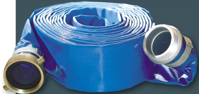
PVC Flexible Discharge Hose