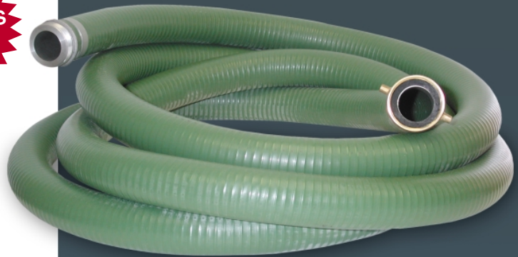
PVC Reinforced Suction Hose